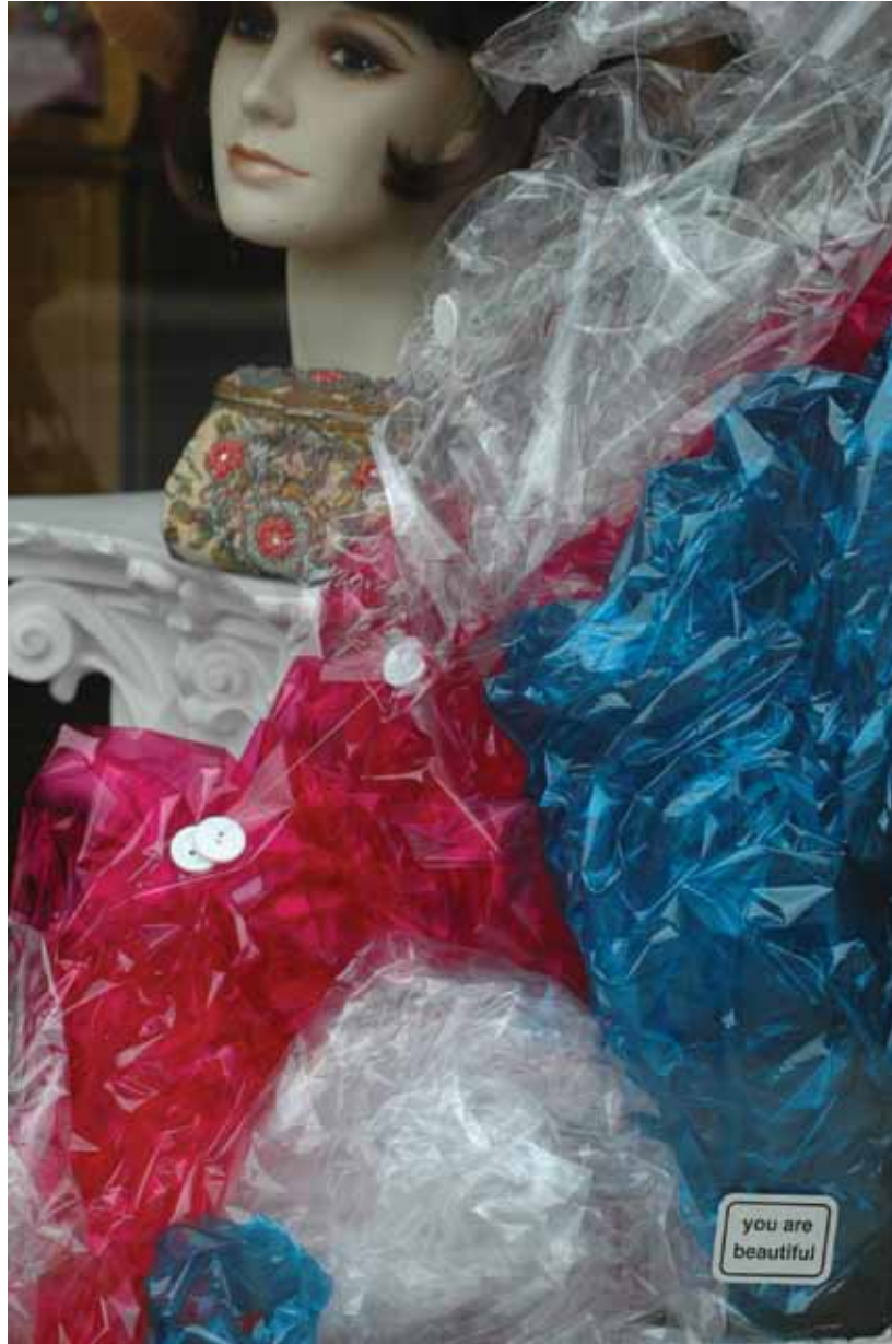
Photograph by Michelle Rivas